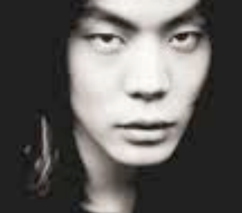
JAMES IHA SMASHING PUMPKINS (1987-2000)

No more promises No more sorrow No longer will I follow Can anybody hear me I just want to be me