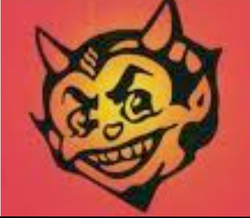
PERRY FERRIL JANE'S ADDICTION (1985-1991) PORNO FOR PYROS (1992-1998)

No more promises No more sorrow No longer will I follow Can anybody hear me I just want to be me