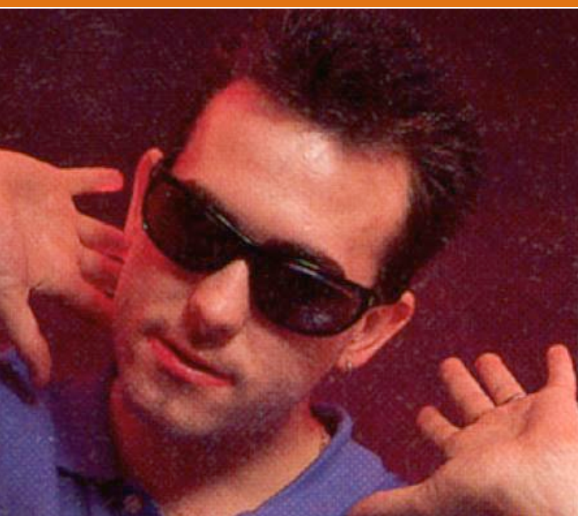
ROBERT SMITH THE CURE (1976-PRESENT)

Jane says, I've never been in love, I don't know what it is Only know if someone wants me I want them if they want me I only know that they want me